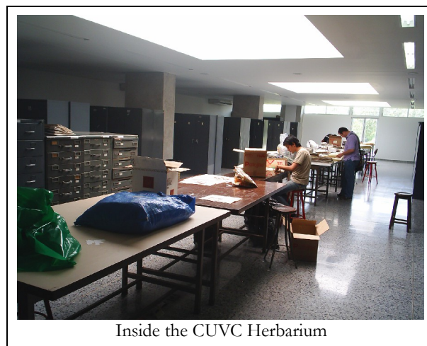
Inside the CUVC Herbarium