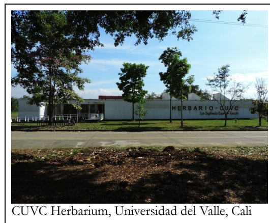
CUVC Herbarium, Universidad del Valle, Cali