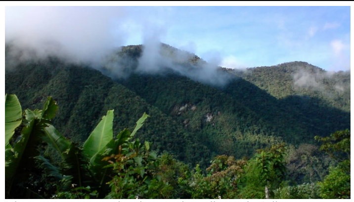
Figure 1. Parque Nacional Natural Farallones de Cali.

Please send your contributions for any of the sessions through the conference webpage or contact us at xiiaroidconference@gmail.com