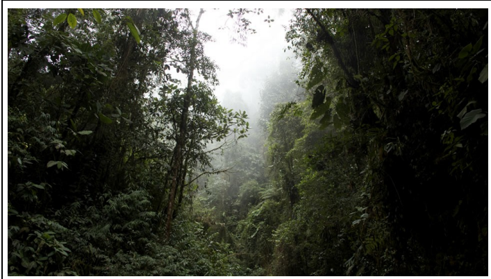
Figure 5. Parque Nacional Natural Farallones de Cali.

Fees will vary according to the amount of people signed up for the trips. You will be able to pay at the conference but registration is necessary. Other field trips could be arranged but please contact us at <u>xiiaroidconference@gmail.com</u>