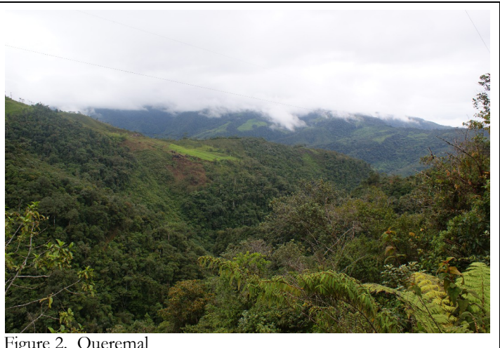
Figure 2. Queremal