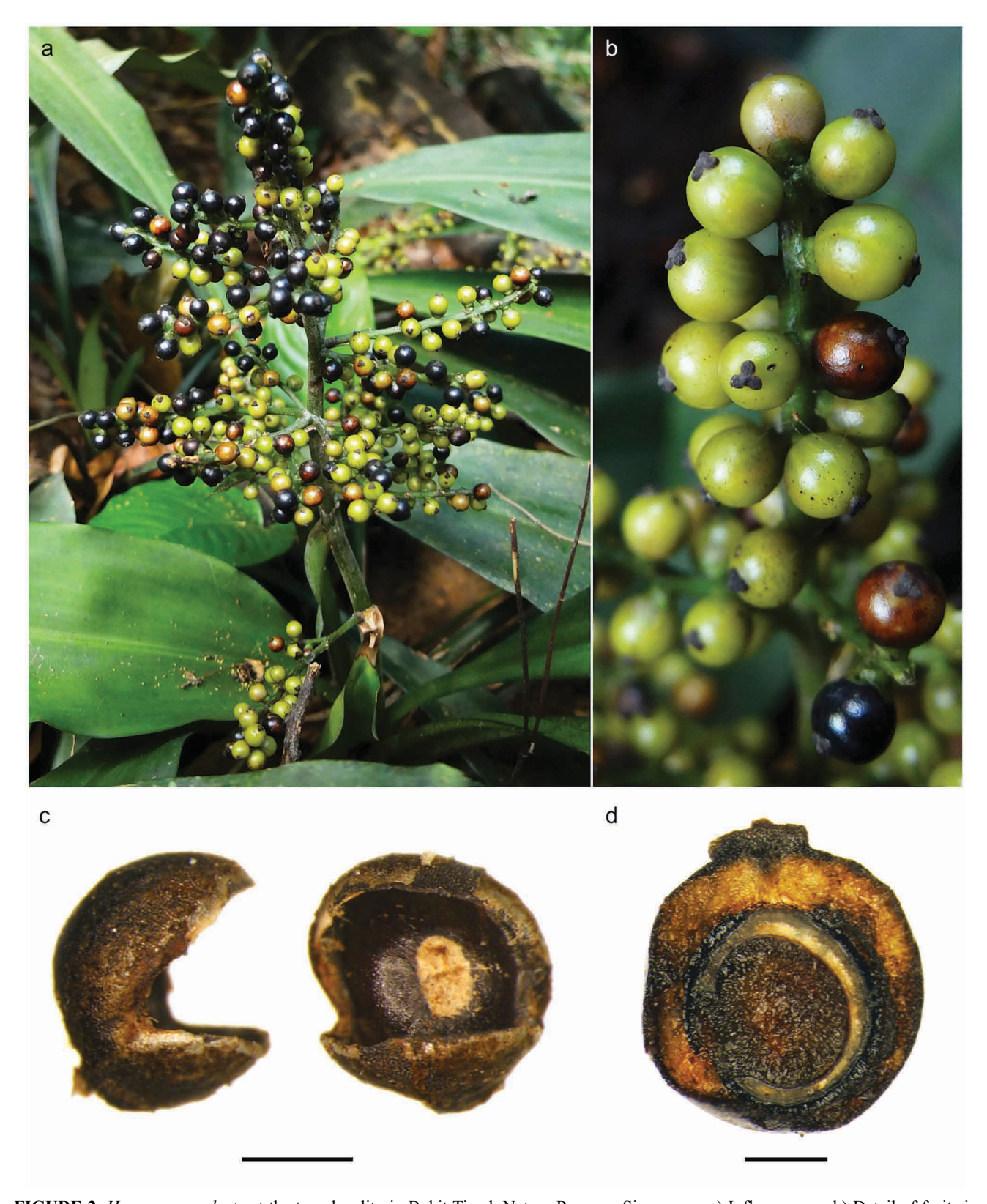
FIGURE 2. Hanguana neglecta at the type locality in Bukit Timah Nature Reserve, Singapore. a) Inflorescence; b) Detail of fruits in various stages of ripeness; c) Seeds (side and front view), scale bar = 2 mm; d) Cross section of ripe fruit, scale bar = 2 mm.

The description is based on living material from the type population, J. Leong-Škorničková & A. Thame JLS-2793 , with exception of description of male inflorescence, which is based on herbarium specimen H.M. Burkill HMB1787 .