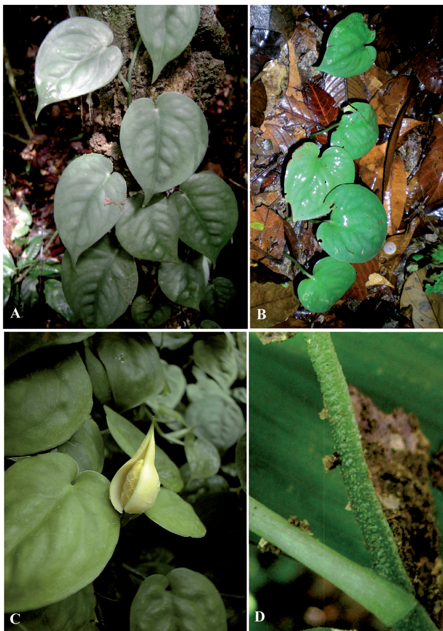
Plate 1. Scindapsus lucens Bogner & P.C.Boyce. A. Juvenile primary axis. Note the glossy quality of the leaf blade (P.C.Boyce & Ng Kiaw Kiaw AR-3054). B. Juvenile plant, jade-green type. (P.C.Boyce & Ng Kiaw Kiaw AR-3063). C. Type clone in cultivation, Jardin Botanique du Montet, Nancy, France (Bogner 2311). D. Detail of stem showing the diagnostic verrucate surface (P.C.Boyce & Ng Kiaw Kiaw AR-3054). Images A & B, D © P.C.Boyce; Image C © David Scherberich, used with permission.