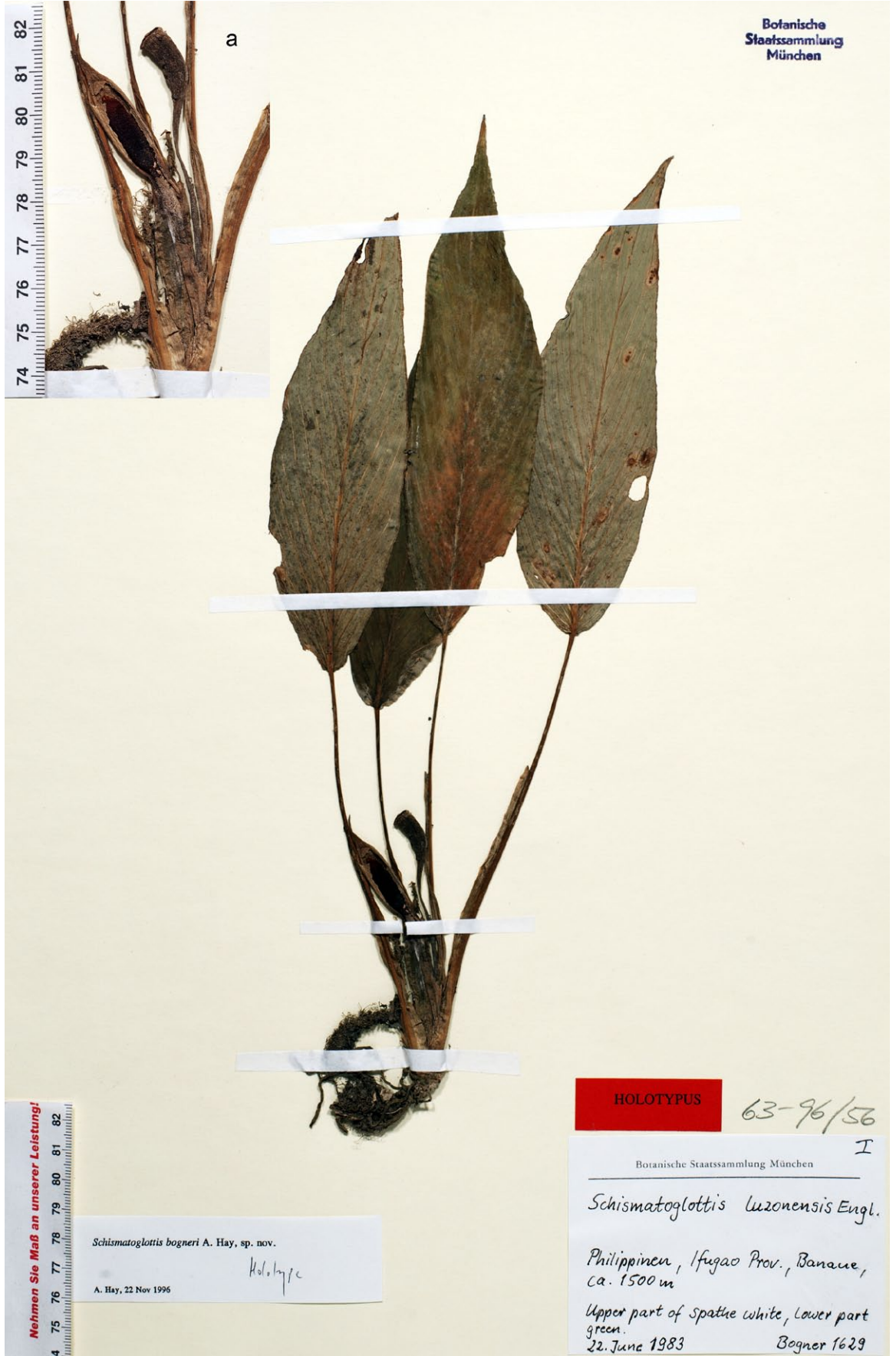
Fig. 3. Schismatoglottis bogneri – holotype Bogner 1629 at M; a: inflorescence enlarged.