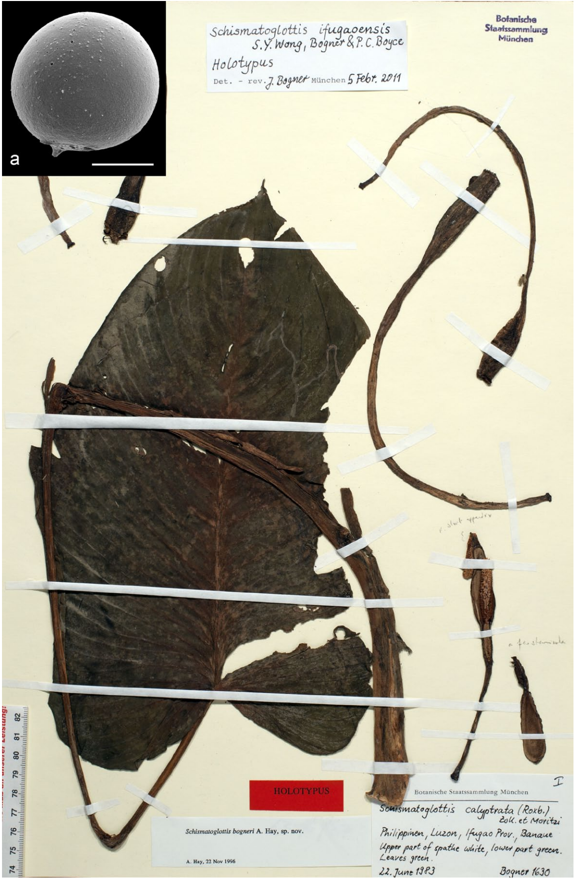
Fig. 2. Schismatoglottis ifugaoensis – holotype Bogner 1630 at M; a: pollen grain. SEM micrograph (a; scale bar = 10 µm)