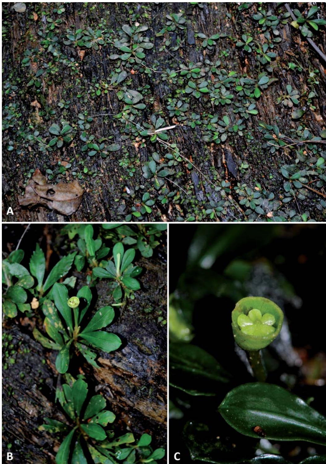
Fig. 2 – Bucephalandra pygmaea (Becc.) P.C. Boyce & S.Y. Wong. A. Extensive population in habitat on shales. B. Detail of plants. The middle specimen in early fruit. C. Detail of the fruiting. The spathe limb has been shed to leave the persistent funnel-form lower spathe. Note that the shield-shaped staminodes have become green and persist to protect the developing fruits, the spent portion of the spadix has fallen.