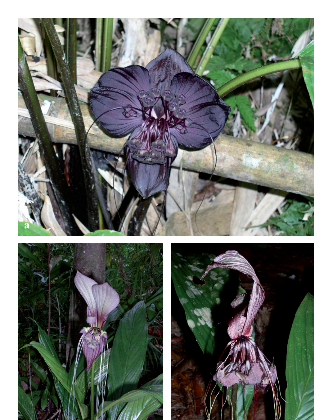
Plate 1a. Tacca borneensis . Note the large homeomorphic involucral bracts. 1b. Tacca integrifolia . W Sarawak form. 1b. Tacca integrifolia NE Sarawak form. Note the rather fleshy inner involucral bracts.