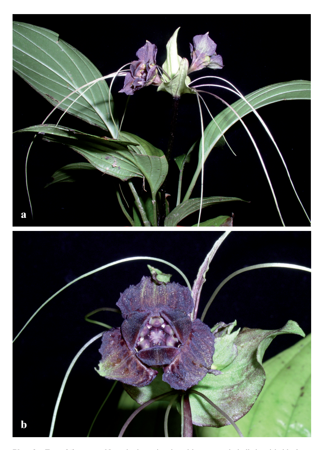
Plate 2a. Tacca bibracteata . Note the inner involucral bracts nearly indistinguishable from the filiform bracts, the inflorescence giving the impression of only two involucral bracts. 2b . Close up of flowers.