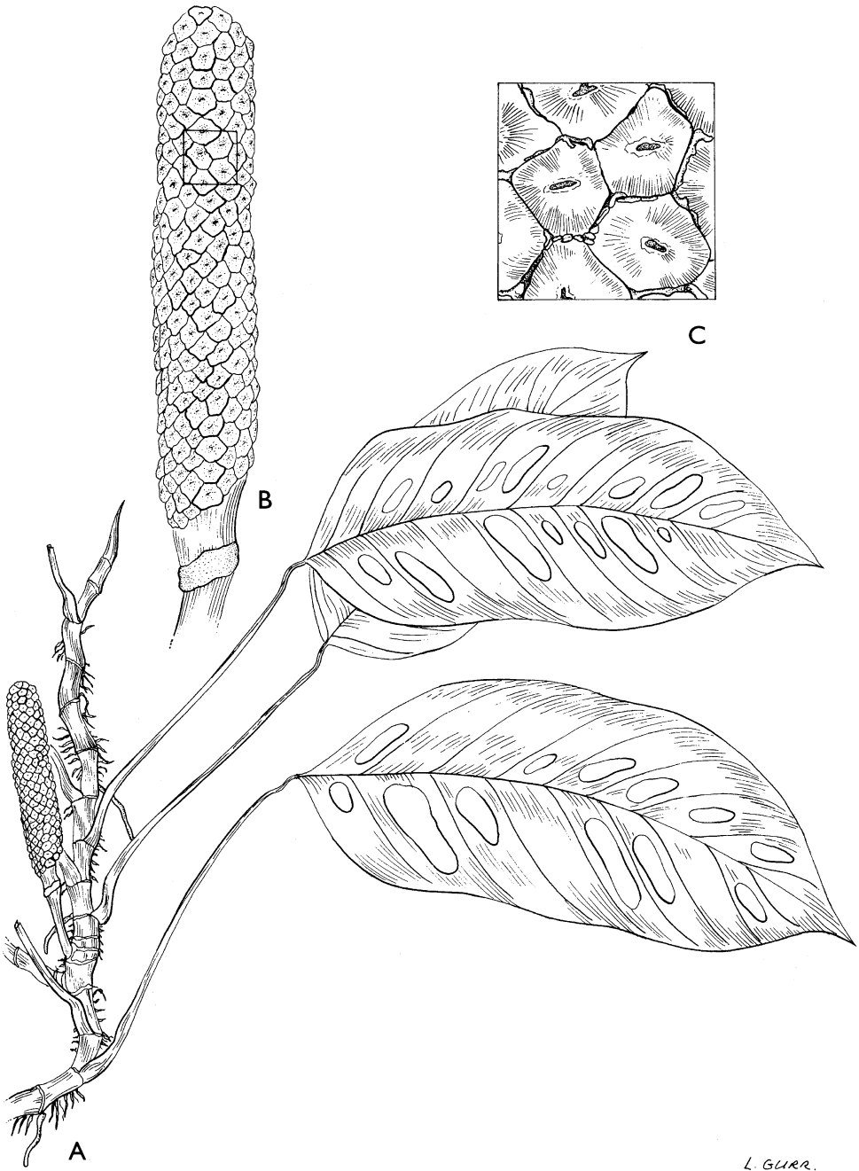
FIG. 2. Amydrium hainanense . A fertile shoot \times 1/4 ; B immature infructescence \times 2/3 ; C spadix detail \times 3 . Drawn from V. D. Nguyen & Croat 77830 by Linda Gurr.