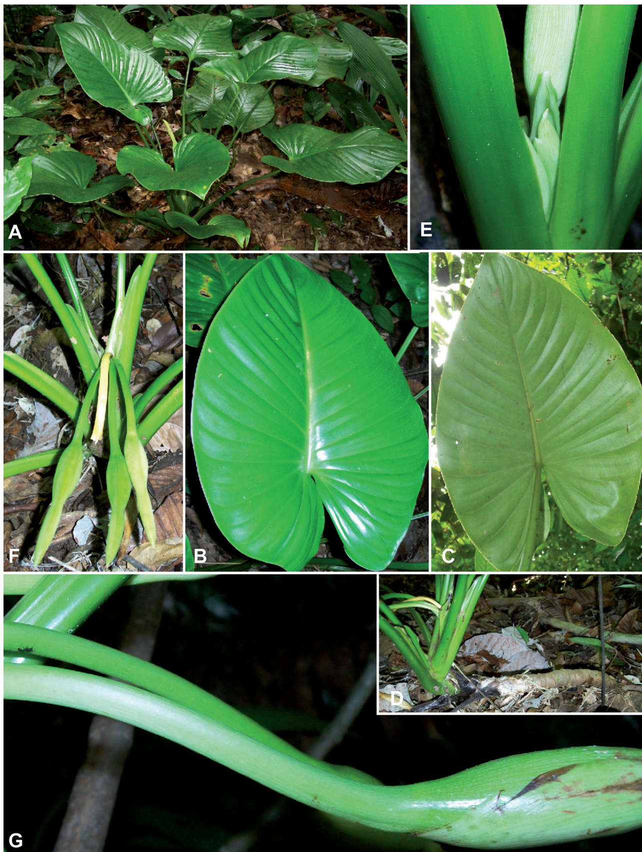
Fig. 1 – Homalomena matangae Y.C. Hoe, S.Y. Wong & P.C. Boyce. A. Plants in type habitat; B. Leaf blade, adaxial surface. Note the glossy bright green surface; C. Leaf blade abaxial surface; note the few primary lateral veins; D. Detail of the stem; E. Synflorescence emerging; note the 2-keeled prophyll; F. Infructescences. Note spathes turning green; G. Peduncle and fruit. Note the pale green longitudinal intermittent striae. All from AR-230.