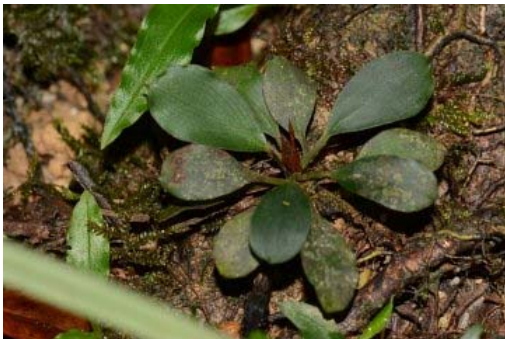
Figure 1. Hottarum truncatum (M.Hotta) Bogner & Nicolson

Hotta's aroid eponymy are the genus Hottarum Bogner & Nicolson ( Figs 1-8 ), Schismatoglottis hottae Bogner & Nicolson ( Figs 9-12 ) and Amorphophallus hottae Bogner & Hett.