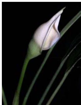
Figure 115. Aridarum borneense (M.Hotta) Bogner & A.Hay