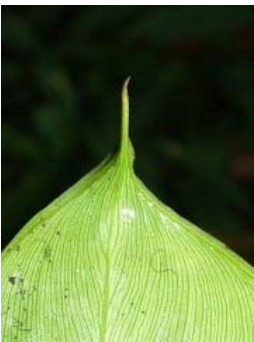
Figure 30. Schismatoglottis monoplacenta M.Hotta