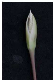
Figure 128. Furtadoa mixta (Ridl.) M.Hotta