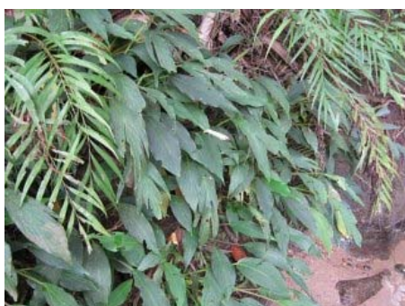
Figure 130. Apoballis okadae (M.Hotta) S. Y.Wong & P.C.Boyce