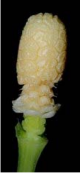
Figure 18. Bucephalandra muluensis (M.Hotta) S.Y.Wong & P.C.Boyce