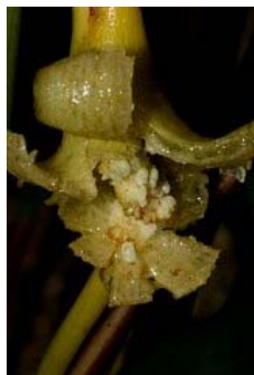
Figure 133. Apoballis okadae (M.Hotta) S.Y.Wong & P.C.Boyce