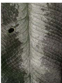
Figure 87. Leaf blade venation detail of Schismatoglottis gamoandra M.Hotta