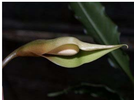
Figure 96. Schismatoglottis schottii Bogner & Nicolson