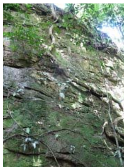
Figure 12. Habitat of Schismatoglottis hottae Bogner & Nicolson