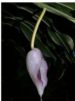
Figure 47. Pothos atropurpurascens M.Hotta