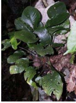
Figure 19. Schismatoglottis multinervia M.Hotta