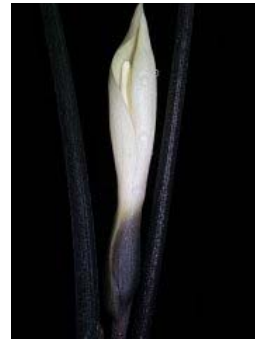
Figure 40. Schismatoglottis colocasioidea M.Hotta