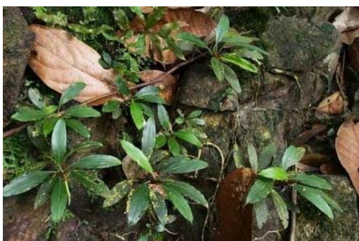
Figure 72. Aridarum longipedunculatum M.Hotta