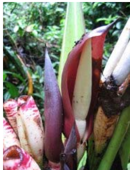
Figure 60. Alocasia robusta M.Hotta