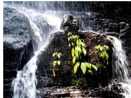
Figure 113. Habitat of Aridarum borneense (M.Hotta) Bogner & A.Hay