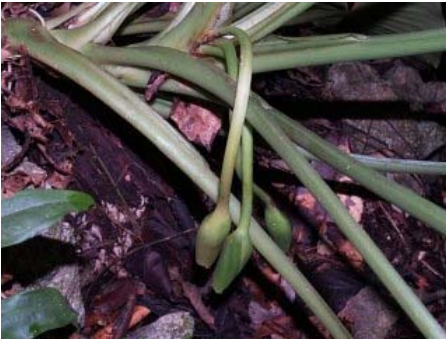
Figure 37. Schismatoglottis muluensis M.Hotta