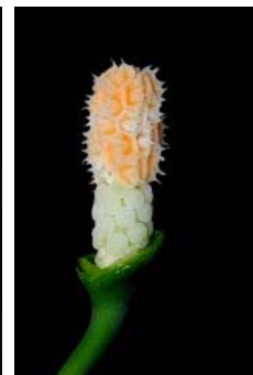
Figure 77. Aridarum purseglovei (Furtado) M.Hotta