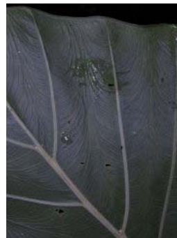
Figure 44. Alocasia sarawakensis M.Hotta