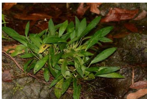
Figure 103. Homalomena minutissima M.Hotta