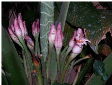
Figure 46. Alocasia sarawakensis M.Hotta