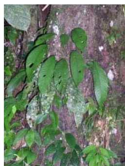
Figure 53. Rhaphidophora megasperma Engl.