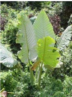
Figure 59. Alocasia robusta M.Hotta