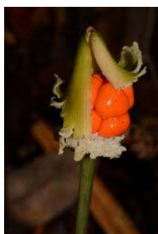
Figure 66. Alocasia peltata M.Hotta