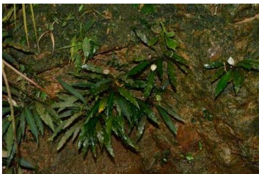
Figure 67. Aridarum caulescens M.Hotta

the 1960s A. montanum had not been recollected; indeed it has only very recently been refound far from the supposed Type locality (Boyce & Wong 2013). Hotta's fieldwork revealed two additional species he assigned to Aridarum , A. caulescens M.Hotta (Figs 67-71) and A. longipedunculatum M.Hotta (Figs 72 & 73). His field observations (although not stated in Hotta (1965b), almost certainly done at Mulu, where A. purseglovei is abundant on exposed shales along forest stream banks) also enabled him to correctly place Furtado's Microcasia purseglovei into Aridarum as Aridarum purseglovei (Furtado) M.Hotta (Figs 74-77). Remarkably there was more to come in the Kuching Herbarium (see below).