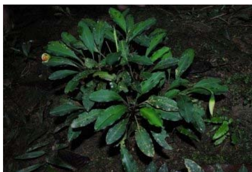
Figure 74. Aridarum purseglovei (Furtado) M.Hotta