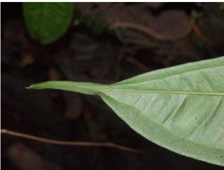
Figure 112. Pedicellarum paiei M.Hotta