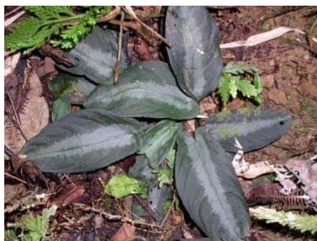
Figure 86. Schismatoglottis gamoandra M.Hotta