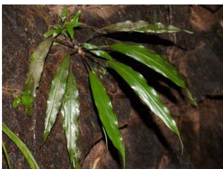
Figure 120. Schottarum sarikeense (Bogner & M.Hotta) P.C.Boyce & S.Y.Wong