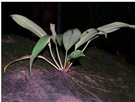
Figure 114. Aridarum borneense (M.Hotta) Bogner & A.Hay