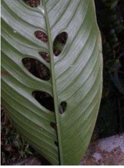
Figure 55. Rhabdophora megasperma Engl.