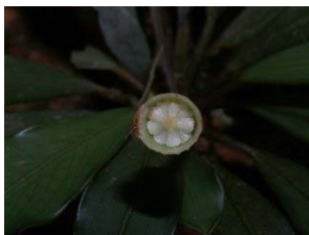
Figure 83. Bucephalandra oblanceolata (M.Hotta) S.Y.Wong & P.C.Boyce