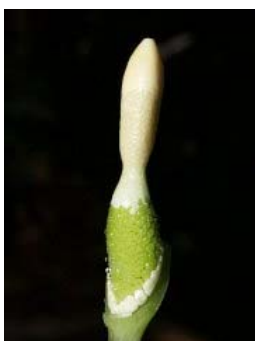
Figure 91. Schismatoglottis gamoandra M.Hotta