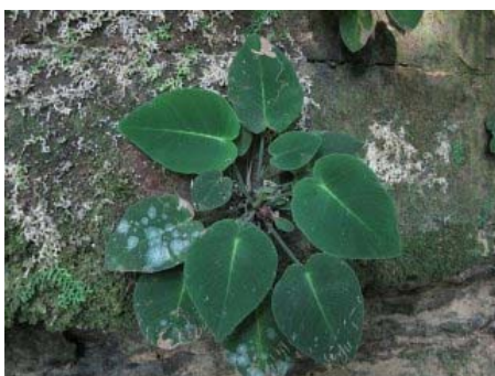
Figure 9. Schismatoglottis hottae Bogner & Nicolson