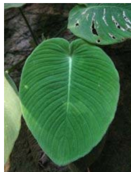
Figure 11. Schismatoglottis hottae Bogner & Nicolson