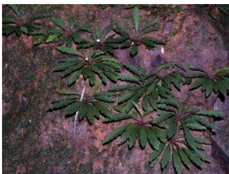
Figure 78. Bucephalandra oblanceolata (M.Hotta) S.Y.Wong & P.C.Boyce

In Hotta's time Beccari's Microcasia was still the subject of misinterpretation owing to errors in the original description of Bucephalandra , confusion that persisted until Bogner's critical paper on Bucephalandra (Bogner 1980) which showed the Type of Microcasia , Microcasia pygmaea Becc., belonged in Bucephalandra . Thus the three species assigned by Hotta to Microcasia (Hotta 1965b) are now in Bucephalandra - M. muluensis M.Hotta = Bucephalandra muluensis (M.Hotta) S.Y.Wong & P.C.Boyce; M. oblanceolata M.Hotta = B. oblanceolata (M.Hotta) S.Y.Wong & P.C.Boyce - Figs 78-83 , and Hottarum ( M. truncatum M.Hotta = Hottarum truncatum (M.Hotta) Bogner & Nicolson). Nevertheless, Hotta's transferal of Furtado's Microcasia purseglovei (to Aridarum ) makes it evident that Hotta was at least aware that Microcasia was heterogeneous.