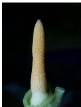
Figure 101. Schismatoglottis platystigma M.Hotta