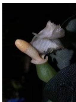
Figure 90. Schismatoglottis gamoandra M.Hotta