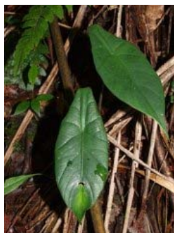
Figure 63. Alocasia peltata M.Hotta