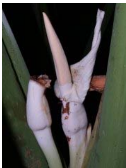
Figure 45. Alocasia sarawakensis M.Hotta