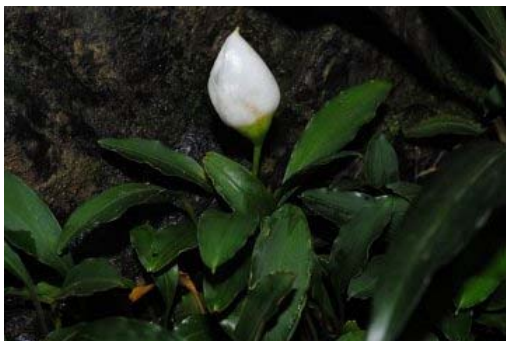
Figure 75. Aridarum purseglovei (Furtado) M.Hotta