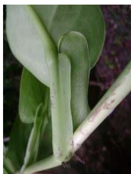
Figure 52. Rhaphidophora latevaginata M.Hotta