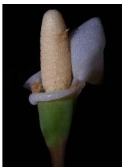
Figure 80. Bucephalandra oblanceolata (M.Hotta) S.Y.Wong & P.C.Boyce