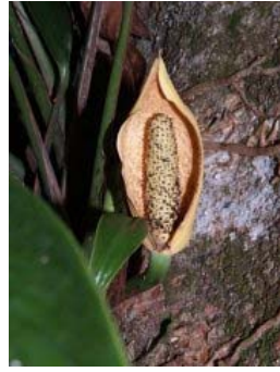
Figure 57. Rhabdophora megasperma Engl.