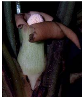
Figure 25. Schismatoglottis multinervia M.Hotta