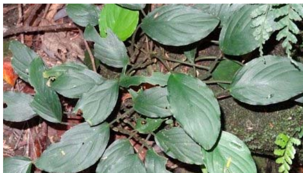
Figure 124. Furtadoa sumatrensis M.Hotta