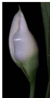
Figure 116. Aridarum borneense (M.Hotta) Bogner & A.Hay