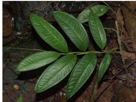
Figure 110. Pedicellarum paiei M.Hotta