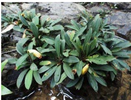
Figure 8. Hottarum sp. nov.