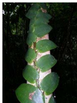
Figure 50. Rhaphidophora latevaginata M.Hotta