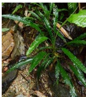
Figure 92. Schismatoglottis erecta M.Hotta