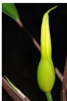
Figure 131. Apoballis okadae (M.Hotta) S. Y.Wong & P.C.Boyce