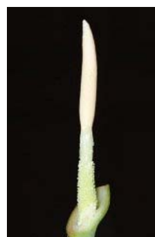
Figure 132. Apoballis okadae (M.Hotta) S. Y.Wong & P.C.Boyce