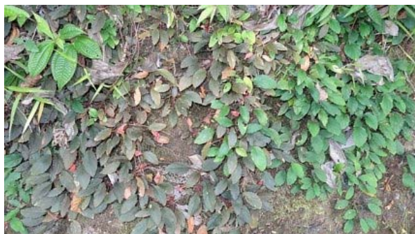
Figure 123. Furtadoa sumatrensis M.Hotta

West Sumatera which he described as a new genus - Furtadoa (Hotta 1981), with a single species: Furtadoa sumatrensis M.Hotta (Figs 123-126). Furtadoa while very clearly allied to Homalomena differs by having each staminate flower with an associated pistillode, unistaminate staminate flowers, and basal placentation. Hotta (1985) transferred a long-anomalous West Malaysian Homalomena into Furtadoa - as F. mixta (Ridl.) M.Hotta (Figs 127-129), in a paper that described five new Homalomena from Sumatera. Hotta's work on Homalomena continued with the production of a checklist for Malesia (Hotta 1986c), and later description of a species with monostaminate staminate flowers [ Homalomena monandra M.Hotta - Hotta (1993b)] which seemed to partially bridge between Furtadoa and Homalomena , although lacking pistillodes, and with typical Homalomena -like parietal placentation. Although by now mainly looking at Homalomena , and increasingly involved with projects outside the Araceae, Hotta continued with other aroid genera from time to time, including a check-list of the genus Anadendrum (Hotta 1986d), and description of yet another striking rheophytic aroid, Schismatoglottis okadae M.Hotta (Hotta 1987 - Figs 130-133). Schismatoglottis okadae was transferred to the resurrected genus Apoballis by Wong & Boyce 2010).