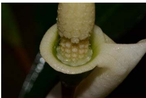
Figure 82. Bucephalandra oblanceolata (M.Hotta) S.Y.Wong & P.C.Boyce