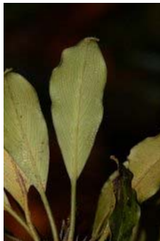
Figure 2. Hottarum truncatum (M.Hotta) Bogner & Nicolson