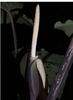
Figure 41. Schismatoglottis colocasioidea M.Hotta