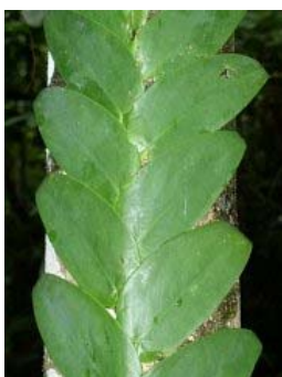
Figure 51. Rhaphidophora latevaginata M.Hotta