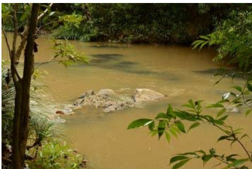
Figure 4. Habitat of Hottarum truncatum (M.Hotta) Bogner & Nicolson