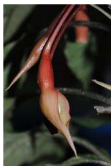
Figure 94. Schismatoglottis erecta M.Hotta