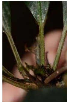
Figure 3. Hottarum truncatum (M.Hotta) Bogner & Nicolson