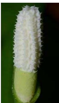
Figure 73. Aridarum longipedunculatum M.Hotta