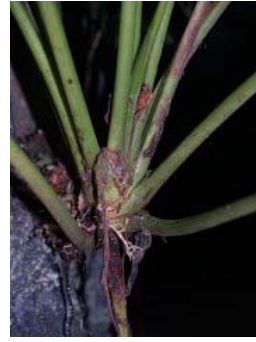
Figure 29. Schismatoglottis monoplacenta M.Hotta