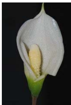
Figure 79. Bucephalandra oblanceolata (M.Hotta) S.Y.Wong & P.C.Boyce