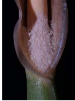
Figure 33. Schismatoglottis monoplocenta M.Hotta