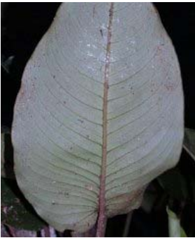
Figure 22. Schismatoglottis multinervia M.Hotta