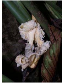
Figure 38. Schismatoglottis muluensis M.Hotta