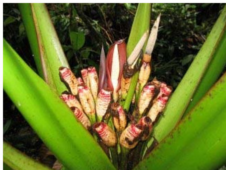
Figure 61. Alocasia robusta M.Hotta