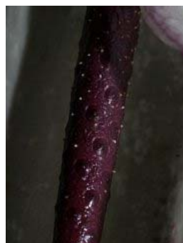
Figure 49. Pothos atropurpurascens M.Hotta