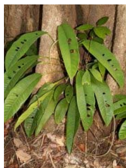
Figure 54. Rhaphidophora megasperma Engl.