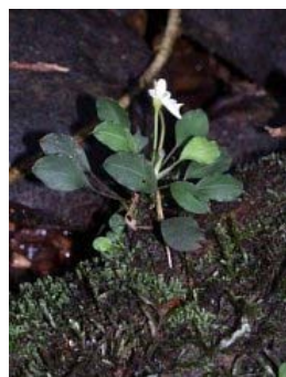
Figure 14. Bucephalandra muluensis (M.Hotta) S.Y.Wong & P.C.Boyce