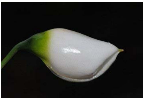
Figure 76. Aridarum purseglovei (Furtado) M.Hotta