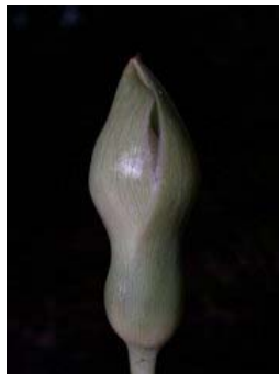
Figure 24. Schismatoglottis multinervia M.Hotta