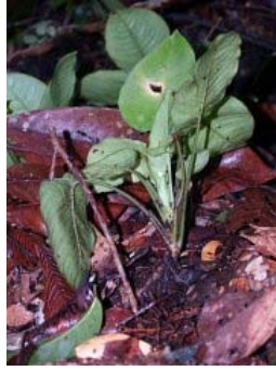
Figure 20. Schismatoglottis multinervia M.Hotta