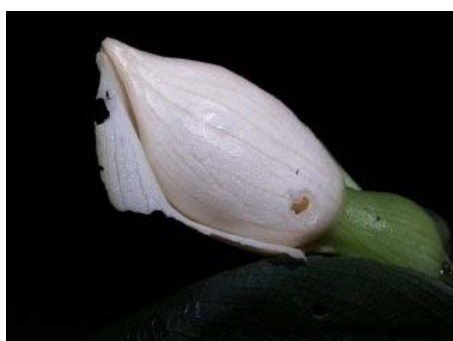
Figure 88. Schismatoglottis gamoandra M.Hotta