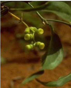
Figure 109. Pedicellarum paiei M.Hotta

As if these field-discoveries were not in themselves remarkable, Hotta concluded his time in Borneo with a visit to the herbarium in Kuching. Here he happened upon two specimens that later formed the basis for two new genera: Pedicellarum and Heteroaridarum (Hotta 1976). Pedicellarum paiei M.Hotta is a pothoid with remarkable pedicellate flowers ( Figs 109-112 ). Heteroaridarum borneense M.Hotta (currently called Aridarum borneense (M.Hotta) Bogner & A.Hay - Figs 113-116 ) is a locally endemic rheophyte from the Matang Massif of NW Sarawak, where it occurs on vertical waterfalls and is unique for the fan-like arrangement of the leaves.