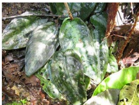
Figure 85. Schismatoglottis gamoandra M.Hotta