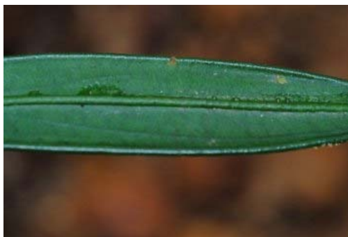
Figure 68. Aridarum caulescens M.Hotta