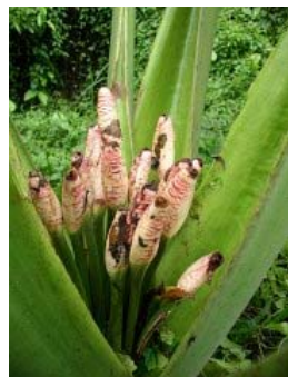
Figure 62. Alocasia robusta M.Hotta