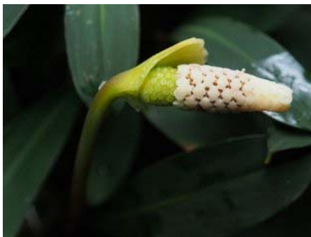
Figure 7. Hottarum sp. nov.