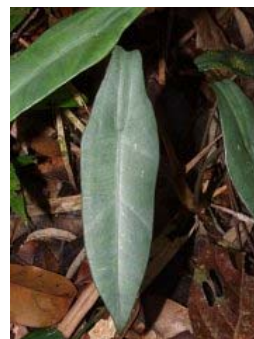
Figure 64. Alocasia peltata M.Hotta