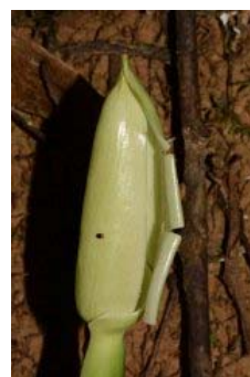
Figure 105. Phymatarum borneense M.Hotta