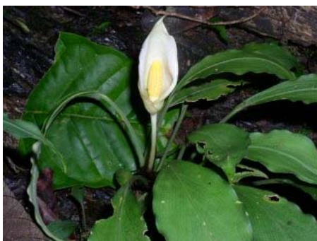
Figure 69. Aridarum caulescens M.Hotta