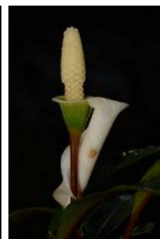
Figure 81. Bucephalandra oblanceolata (M.Hotta) S.Y.Wong & P.C.Boyce