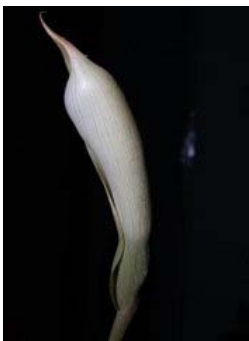
Figure 119. Schismatoglottis mayoana Bogner & M.Hotta