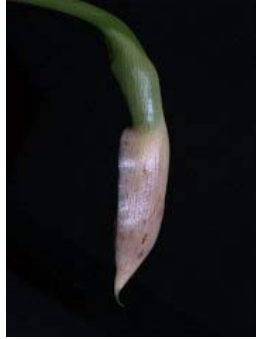
Figure 32. Schismatoglottis monoplocenta M.Hotta