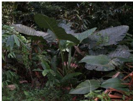
Figure 43. Alocasia sarawakensis M.Hotta