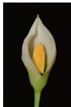
Figure 71. Aridarum caulescens M.Hotta