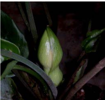
Figure 23. Schismatoglottis multinervia M.Hotta