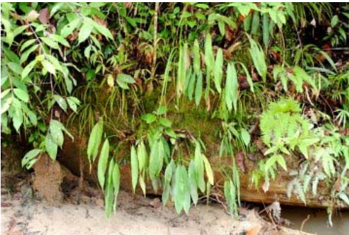
Figure 58. Homalomena geniculata M.Hotta