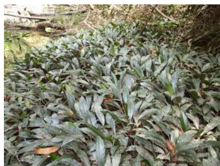
Figure 104. Phymatarum borneense M.Hotta