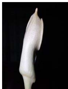
Figure 100. Schismatoglottis platystigma M.Hotta