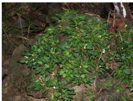
Figure 13. Bucephalandra muluensis (M.Hotta) S.Y.Wong & P.C.Boyce

Of particular note during this Borneo period is a week towards the end of March spent at Gunung Mulu, in NE Sarawak. During this time Hotta made the first systematic study of the remarkably rich aroid flora of the Mulu limestones. Taxonomic outputs from his time at Mulu include the description of several Mulu endemics: Bucephalandra (then Microcasia ) muluensis (Figs 13-18), Schismatoglottis multinervia M. Hotta (Figs 19-26), the remarkable limestone chasmophyte Schismatoglottis monoplecanta M.Hotta (Figs 27-33), and Schismatoglottis muluensis M.Hotta (Figs. 34-38). Other notable species described from Mulu, although not restricted to there, are Schismatoglottis colocasioidea M.Hotta (Figs 39-42), Alocasia sarawakensis M.Hotta (Figs 43-46), and Phymatarum montanum M.Hotta (the last now considered synonymous with P. borneense M.Hotta).