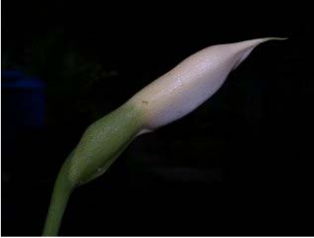
Figure 31. Schismatoglottis monoplocenta M.Hotta