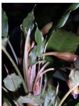
Figure 93. Schismatoglottis erecta M.Hotta