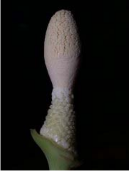
Figure 26. Schismatoglottis multinervia M.Hotta