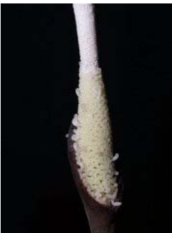
Figure 42. Schismatoglottis colocasioidea M.Hotta