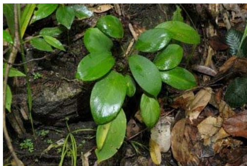
Figure 127. Furtadoa mixta (Ridl.) M.Hotta