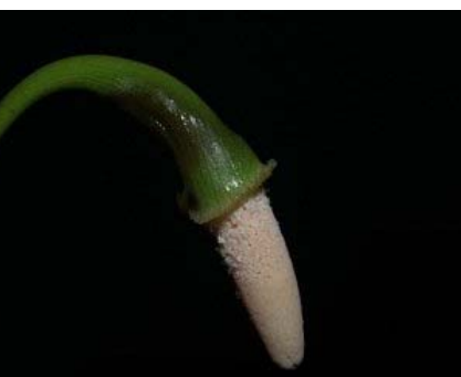
Figure 122. Schottarum sarikeense (Bogner & M.Hotta) P.C.Boyce & S.Y.Wong