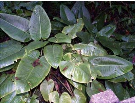
Figure 34. Schismatoglottis muluensis M.Hotta