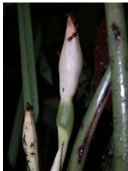
Figure 36. Schismatoglottis muluensis M.Hotta