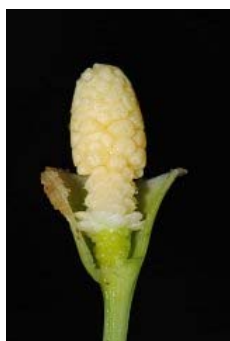
Figure 17. Bucephalandra muluensis (M.Hotta) S.Y.Wong & P.C.Boyce