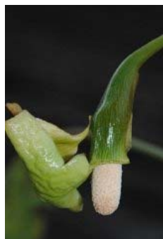
Figure 97. Schismatoglottis schottii Bogner & Nicolson