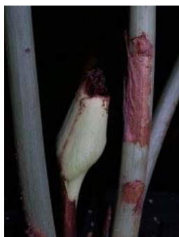
Figure 102. Schismatoglottis platystigma M.Hotta