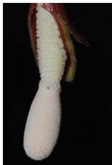
Figure 95. Schismatoglottis erecta M.Hotta