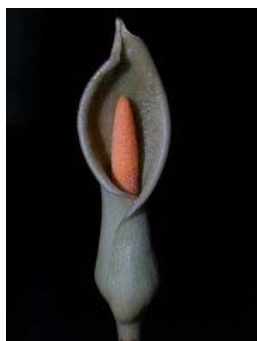
Figure 99. Schismatoglottis platystigma M.Hotta

Hotta's time in Brunei, aside from aforementioned Schismatoglottis hottae (Figs 9-12), Bucephalandra (then Microcasia ) oblanceolata (M.Hotta) S.Y.Wong & P.C.Boyce, revealed yet more new Schismatoglottis , including the peculiar Schismatoglottis platystigma M.Hotta (Figs 99-102), the smallest then and still Homalomena minutissima M.Hotta (Fig 103), and what was used as the Type species for the genus Phymatarum - P. borneense M.Hotta (Figs 104-108).