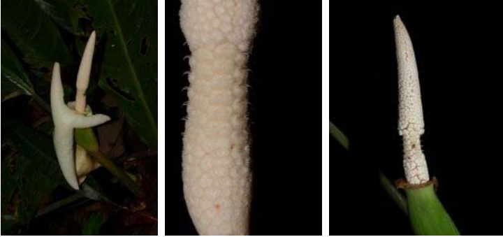
Figure 106. Phymatarum borneense M.Hotta