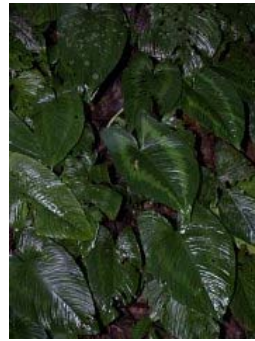
Figure 39. Schismatoglottis colocasioidea M.Hotta