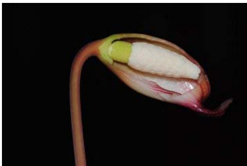
Figure 6. Hottarum sp. nov.