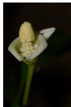
Figure 16. Bucephalandra muluensis (M.Hotta) S.Y.Wong & P.C.Boyce