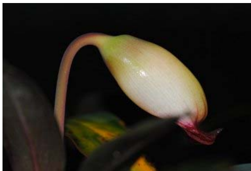
Figure 5. Hottarum sp. nov.