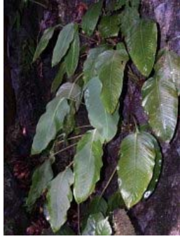
Figure 27. Schismatoglottis monoplacenta M.Hotta