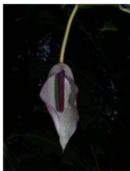
Figure 48. Pothos atropurpurascens M.Hotta