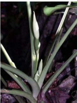
Figure 35. Schismatoglottis muluensis M.Hotta