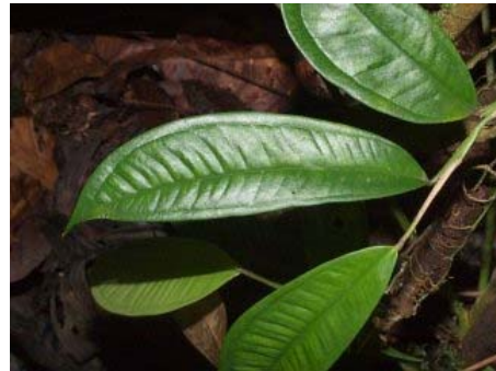
Figure 111. Pedicellarum paiei M.Hotta