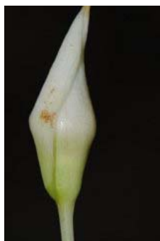
Figure 15. Bucephalandra muluensis (M.Hotta) S.Y.Wong & P.C.Boyce