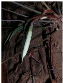
Figure 118. Schismatoglottis mayoana Bogner & M.Hotta