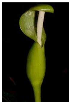
Figure 65. Alocasia peltata M.Hotta