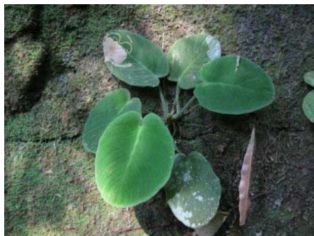
Figure 10. Schismatoglottis hottae Bogner & Nicolson