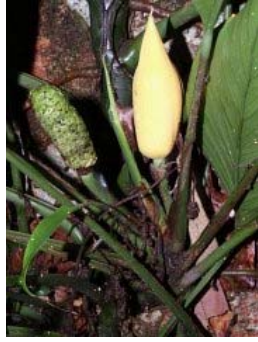
Figure 56. Rhabdophora megasperma Engl.