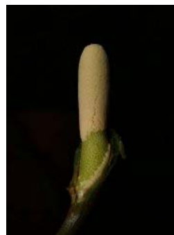
Figure 98. Schismatoglottis schottii Bogner & Nicolson

Hotta's time in Brunei, aside from aforementioned Schismatoglottis hottae (Figs 9-12), Bucephalandra (then Microcasia ) oblanceolata (M.Hotta) S.Y.Wong & P.C.Boyce, revealed yet more new Schismatoglottis , including the peculiar Schismatoglottis platystigma M.Hotta (Figs 99-102), the smallest then and still Homalomena minutissima M.Hotta (Fig 103), and what was used as the Type species for the genus Phymatarum - P. borneense M.Hotta (Figs 104-108).