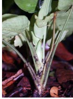
Figure 21. Schismatoglottis multinervia M.Hotta