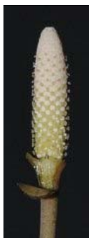
Figure 126. Furtadoa sumatrensis M.Hotta