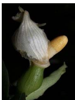
Figure 89. Schismatoglottis gamoandra M.Hotta