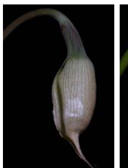
Figure 121. Schottarum sarikeense (Bogner & M.Hotta) P.C.Boyce & S.Y.Wong