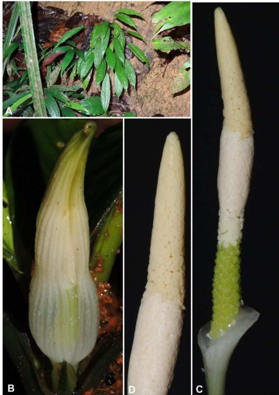
Figure 2. Schismatoglottis camera-lucida P.C.Boyce & S.Y.Wong. A. Plant in habitat, Type locality. B. Inflorescence at pistillate anthesis. Note that lower spathe walls are translucent and that the staminate flower zone is clearly visible; note, too that the spathe limb barely opens. C. Spadix at pistillate anthesis, spathe artificially removed. D. Detail of the appendix and the upper part of the staminate flower. All from K. Nakamoto AR-3849 .