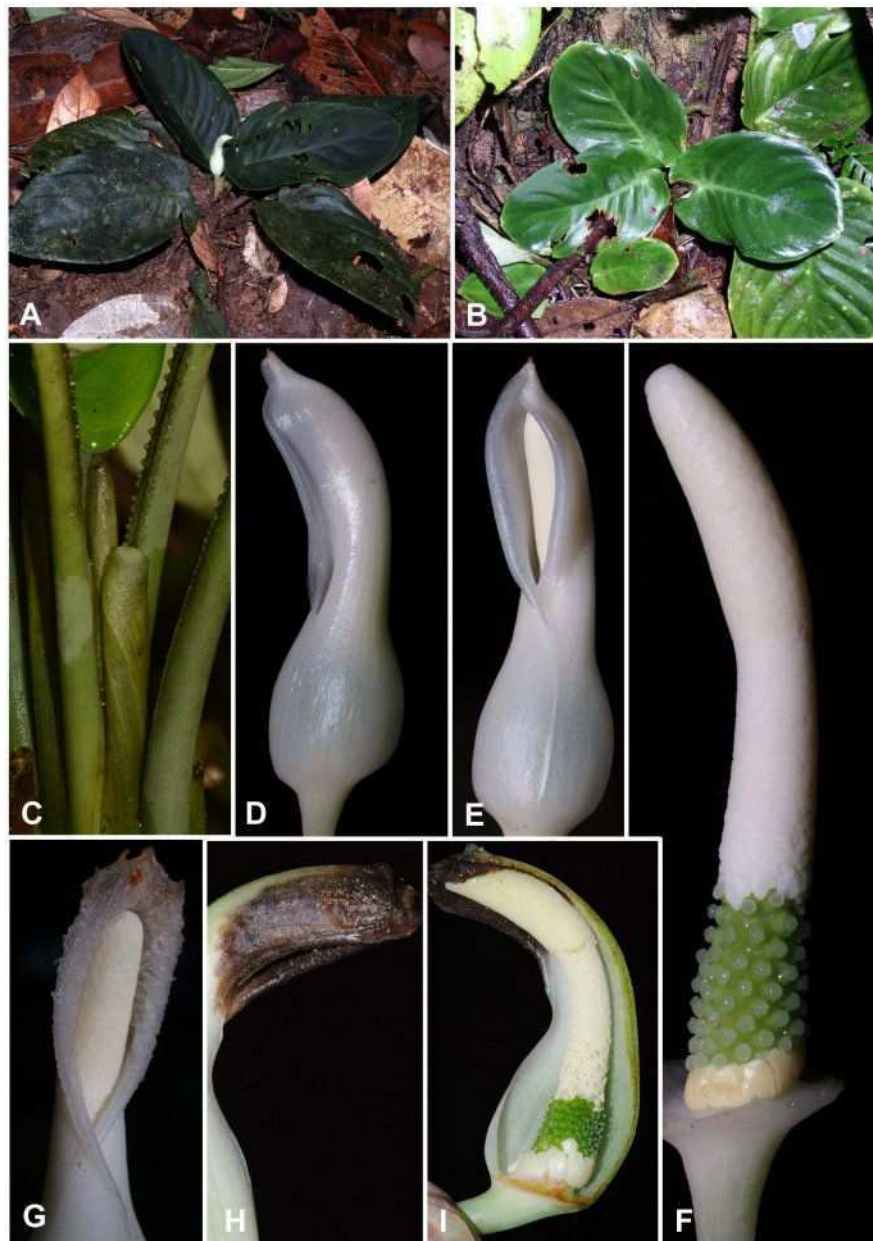
Figure 3. Schismatoglottis gampospadix P.C.Boyce & S.Y.Wong. A. & B. Plants in habitat. Note that the rosettes of leaves in B are each attached to a common rhizome-like stem. C. Detail of the petioles, showing the ligular extension to the petiolar sheath and the crispulate dorsal edges to the petiole. D. & E. Inflorescence at pistillate anthesis. F. Spadix at staminate anthesis, spathe artificially removed. Note the large staminodes at the base of the pistillate flower zone. G. Detail of the deliquescing spathe limb margins, inflorescence at late staminate anthesis. H. Spathe limb with dry-marcescent margins, end of staminate anthesis. I. Inflorescence at end of staminate anthesis, nearside half of spathe artificially removed. A, C – G from P.C.Boyce, Wong Sin Yeng & Jepom ak Tisai AR-2420; B, H – I from P.C.Boyce & Jepom ak Tisai AR-540.