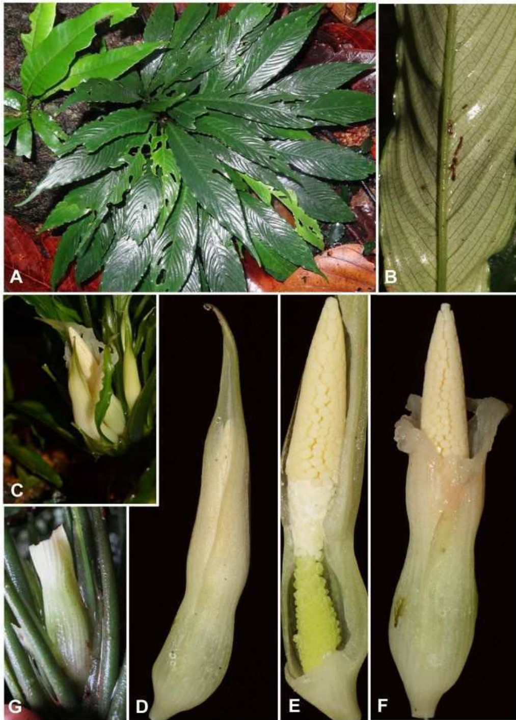
Figure 4. Schismatoglottis gui P.C.Boyce & S.Y.Wong. A. Plant in habitat, Type locality. B. Detail of venation, abaxial surface of leaf blade; note the tessellate secondaries. C. Synflorescence. D. Inflorescence at pistillate anthesis. Note that the spathe limb barely opens. E. Spadix at staminate anthesis, spathe artificially removed. F. Inflorescence post-anthesis. Note that the spathe limb has largely deliquesced. G. All from P.C.Boyce & S.Y.Wong AR-3536.