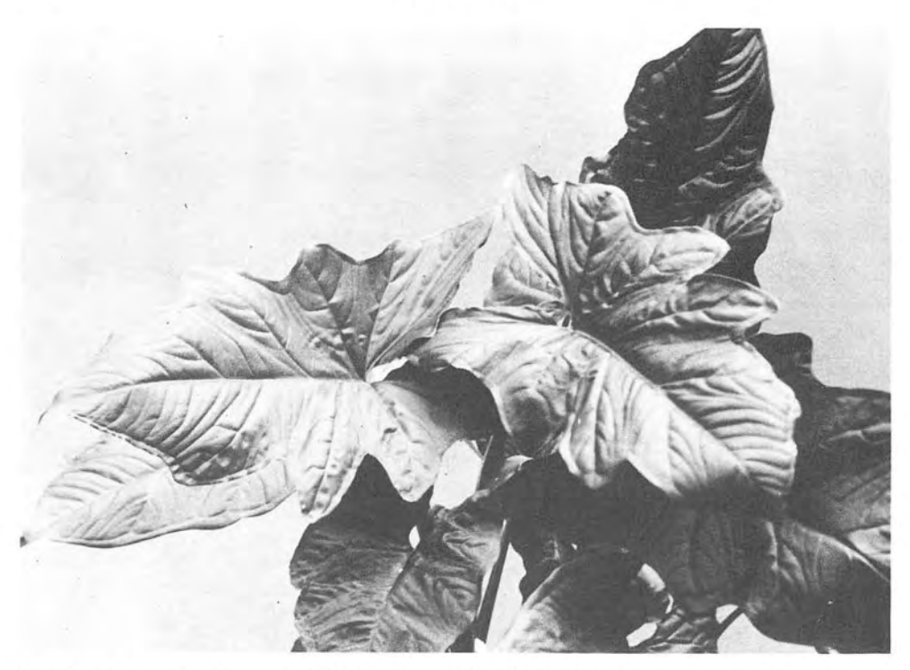
Fig. 1. Syngonium steyermarkii Croat; juvenile plant. X 1/4