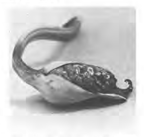
Fig. 5. Syngonium steyermarkii Croat; young infructescence X 3/4