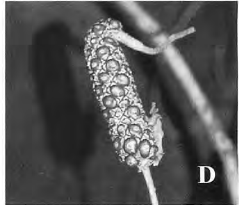
Fig. 1. Anthurium rionegrense . A. Habit. B. Detail of leaf (adaxial surface). C. Inflorescence. D. Immature infructescence.