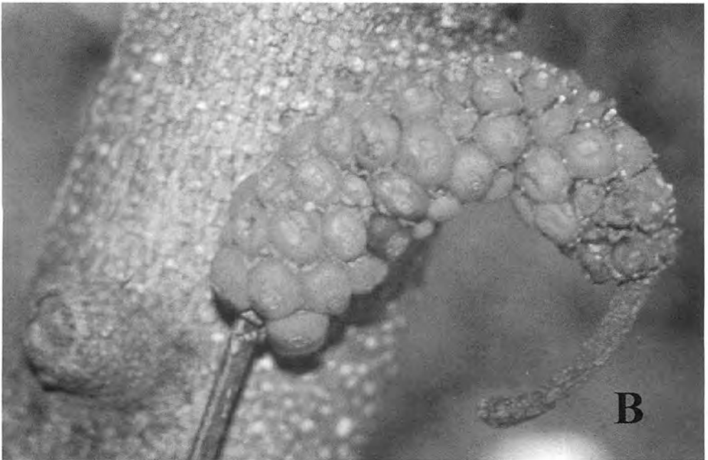
Fig. 2. Anthurium rionegrense . A. Detail of the rhizome. B. Mature infructescence.