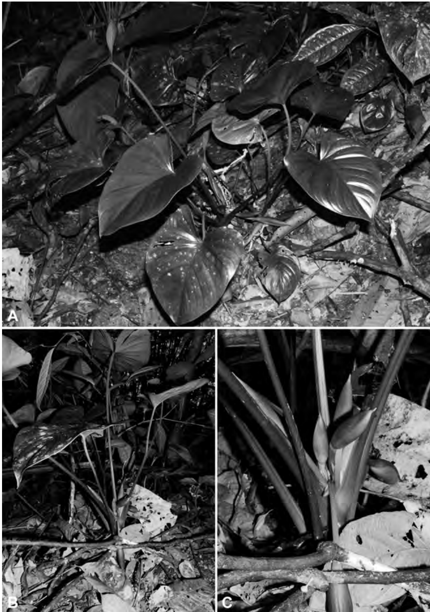
Fig. 1. Homalomena selaburensis P.C.Boyce & S.Y.Wong. A. Flowering plant in habitat. Note the highly polished leaf blades. B. Plant in habitat with the matte abaxial surface of the leaf blades and scabridulous petioles visible. C. Details of developing inflorescences. A–C from AR-1730.

ovary in width, capitate, greyish white, papillate at pistillate anthesis; interpistillar staminodes oblong-clavate on a short, very slender stipe, staminode slightly exceeding the height of the