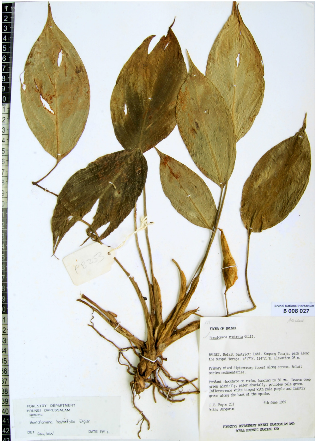
Fig. 3. Homalomena scutata – holotype specimen: P. C. Boyce 253 (BRUN – B 008 027).