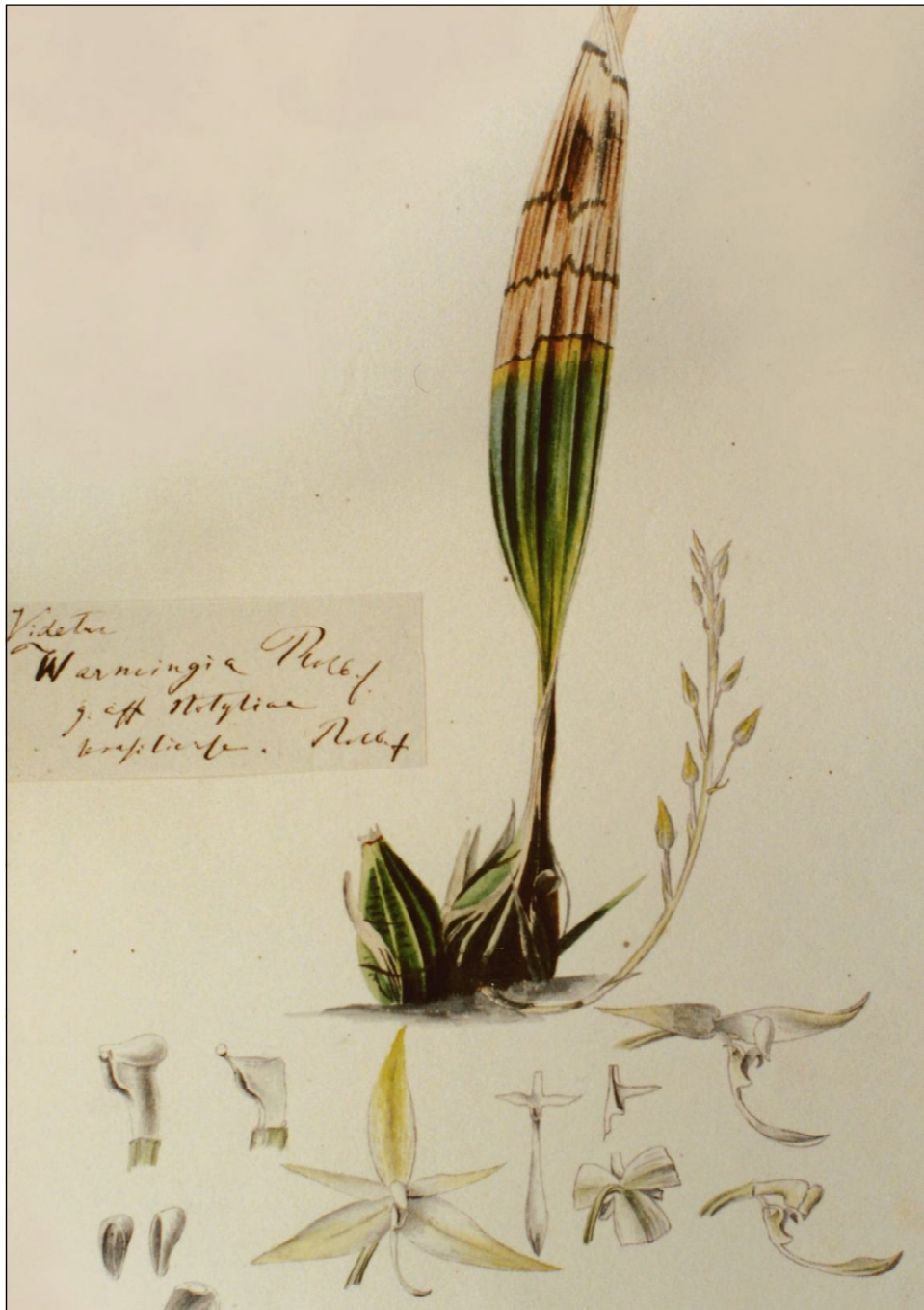
Figure 1. The orchid Archivea kewensis , nomenclaturally perhaps the “epitomic” missing species.

However, many aroid species remain elusive. Two of these, from Borneo, are the subject of this short piece.