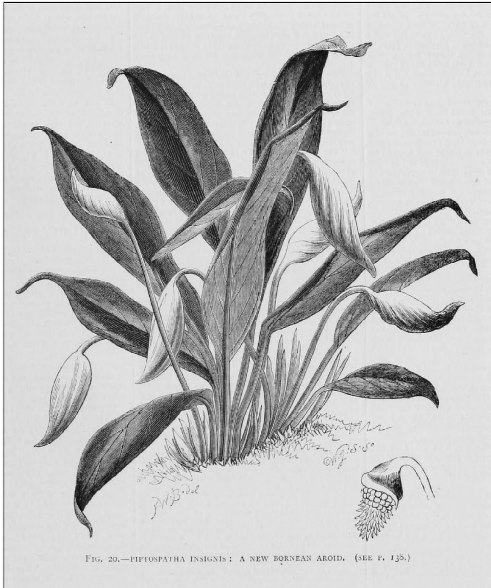
Figure 5. Piptospatha insignis N.E.Br. Plate from The Gardeners' chronicle , n.s. 11, 138-139, Fig.20 (1879).

was at least for three years successfully in cultivation, but originating from a wild collection recorded as a decidedly vague 'North Borneo' that now persists only as dried specimens and two illustrations. As with Aridarum montanum the re-collection of P. insignis is scientifically important as it is the type species for the genus. Additionally, the staminate flower structure of P. insignis is quite unlike that of any other known species and this raises interesting questions about the likelihood that despite recent revisions Piptospatha is still not yet fully resolved (Wong & Boyce, 2010; Wong et al., 2010).