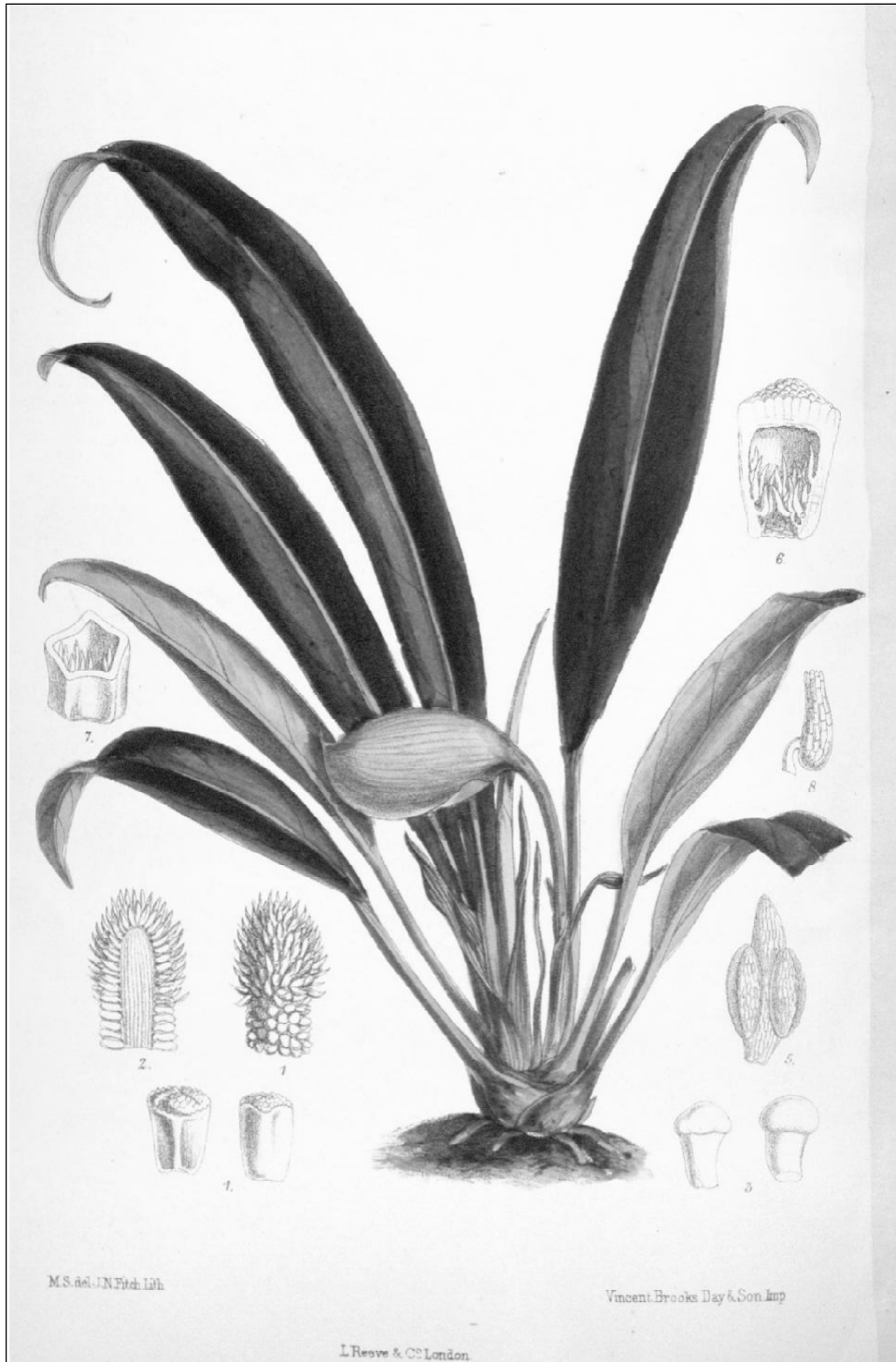
Figure 6. Piptospatha insignis N.E.Br. Reproduced from Curtis's Botanical Magazine 107 [ser.3, v.37], t.6598 (1881).