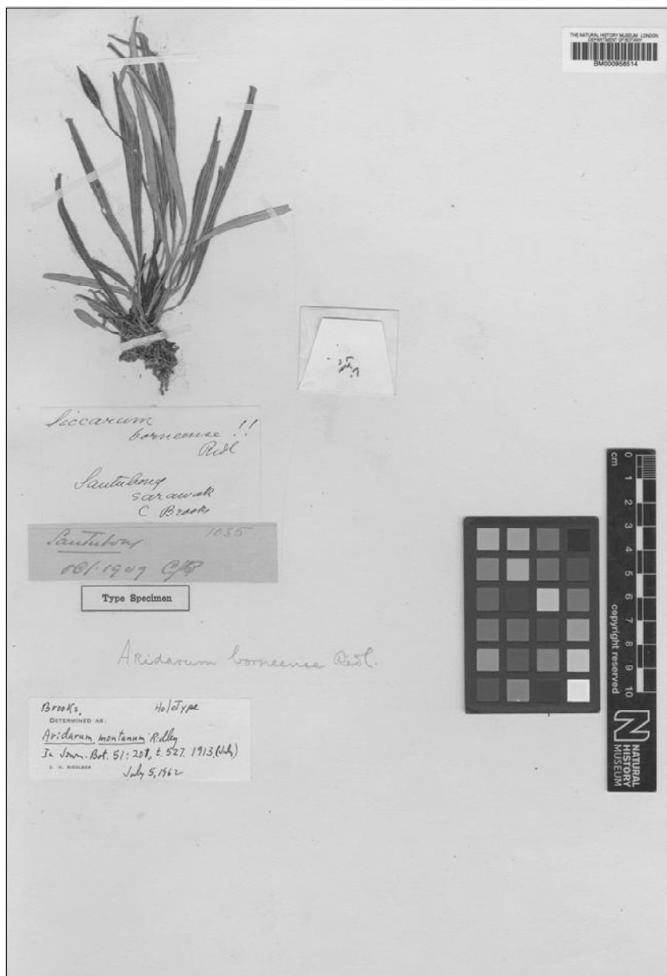
Figure 3. Aridarum montanum Ridl. Cecil Joslin Brooks' collection (now in the Natural History Museum, London – BM) that forms the basis for Ridley's description, and which serves as the type of Aridarum . This is the only known collection, there being no duplicate specimens and no other known collections.