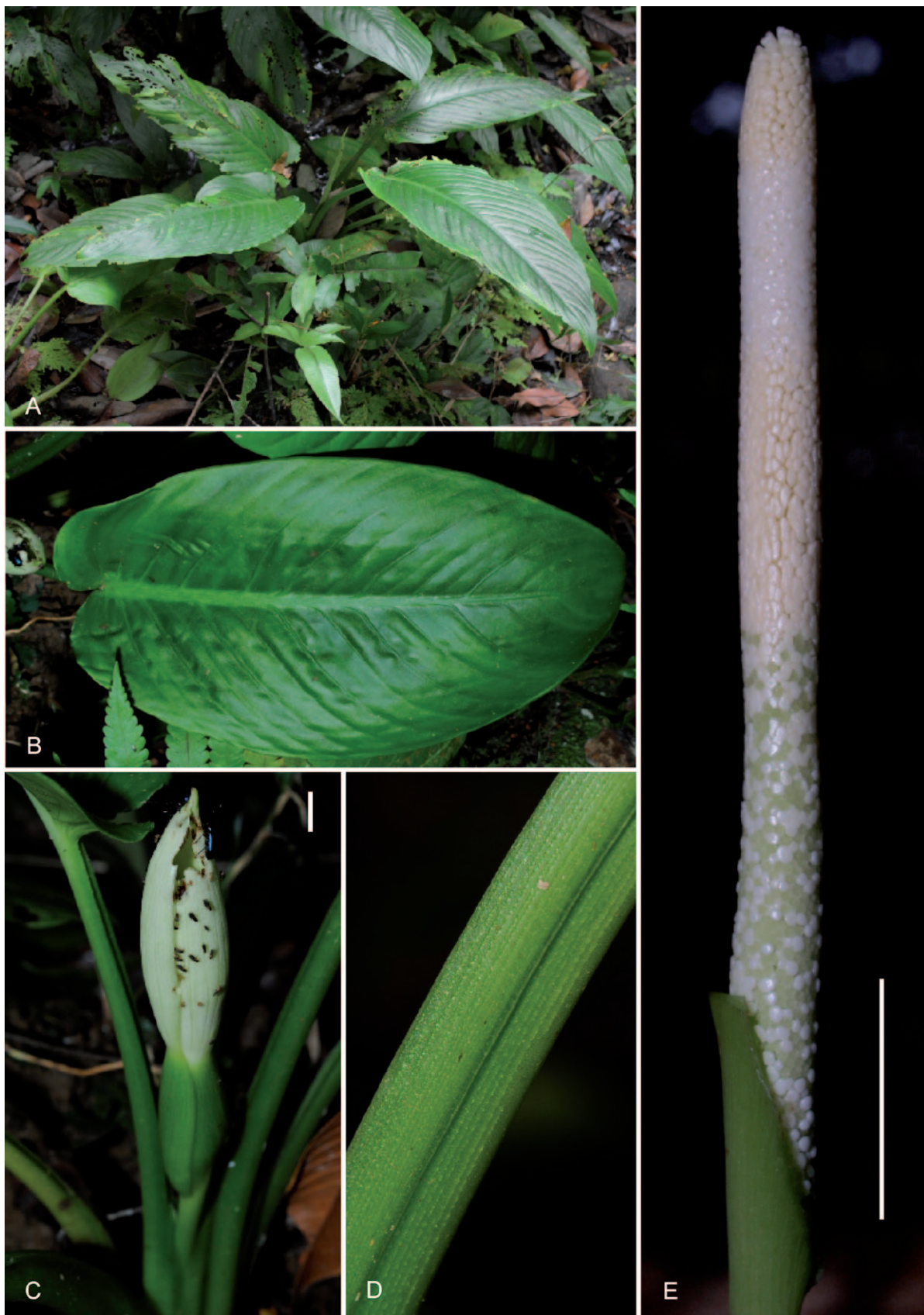
Fig. 2. Schismatoglottis ranchanensis – A: plants in habitat; B: leaf blade; note the conspicuously raised primary venation; C: inflorescence at pistillate anthesis, the inflated spathe limb coincides with the upper part of pistillate flower zone; D: petiole showing the longitudinal ridges and D-shaped cross section; E: inflorescence with spathe artificially removed to reveal the long interstice, c. \frac{1}{4} of the spadix length, and the button-like interstillar staminodes. – Photographs from the type collection; scale bars: C + E = 1 cm.